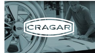
If design requires, white logo can be used on images, if contrast is appropriate and logo is easily recognisable.