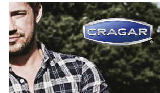
If design requires, color logo can be used on images, if contrast is appropriate and logo is easily recognisable.