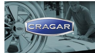
If design requires, color logo can be used on images, if contrast is appropriate and logo is easily recognisable.