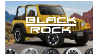
White logo can be used even on busy images, if drop shadow separates it properly from the background.