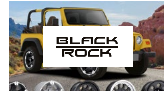
You can use a white section under the color logo on busy images.