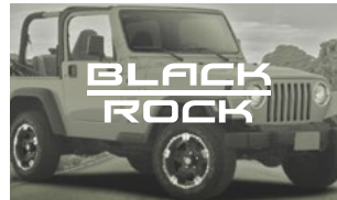
If design requires, white logo can be used on images, if contrast is appropriate and logo is easily recognisable.